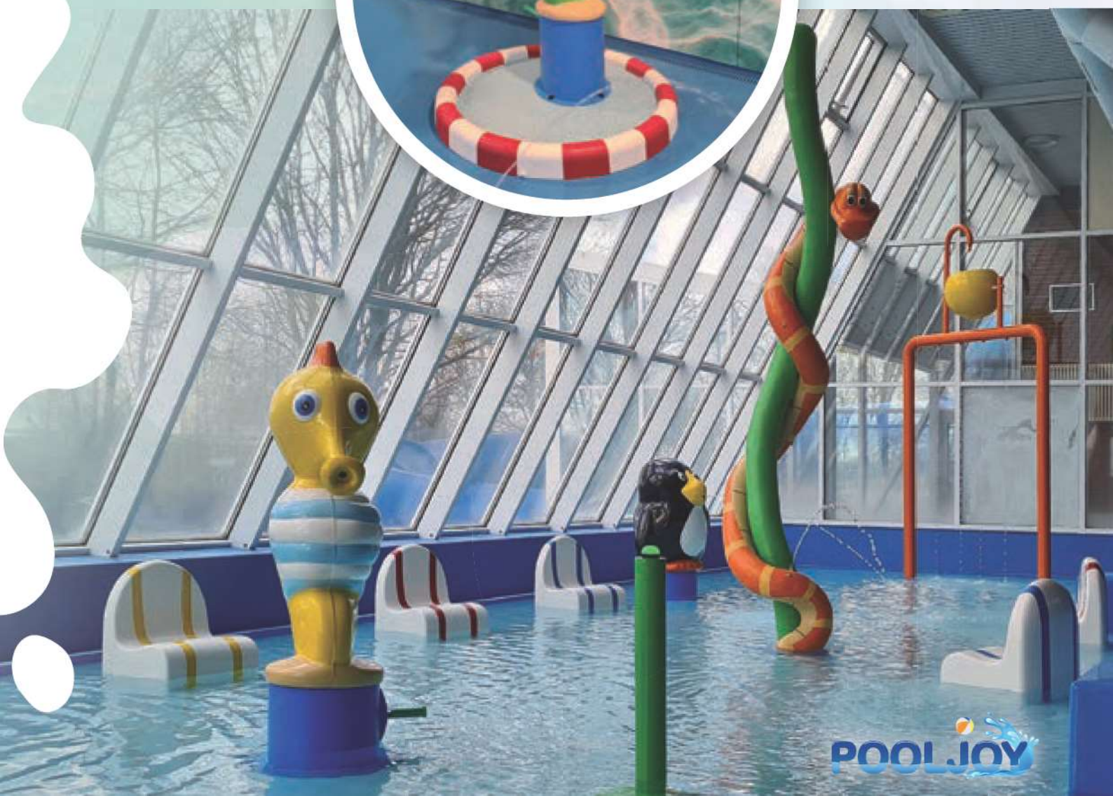
ANIMAL FIGURES - TIERFIGUREN - DIERFIGUREN